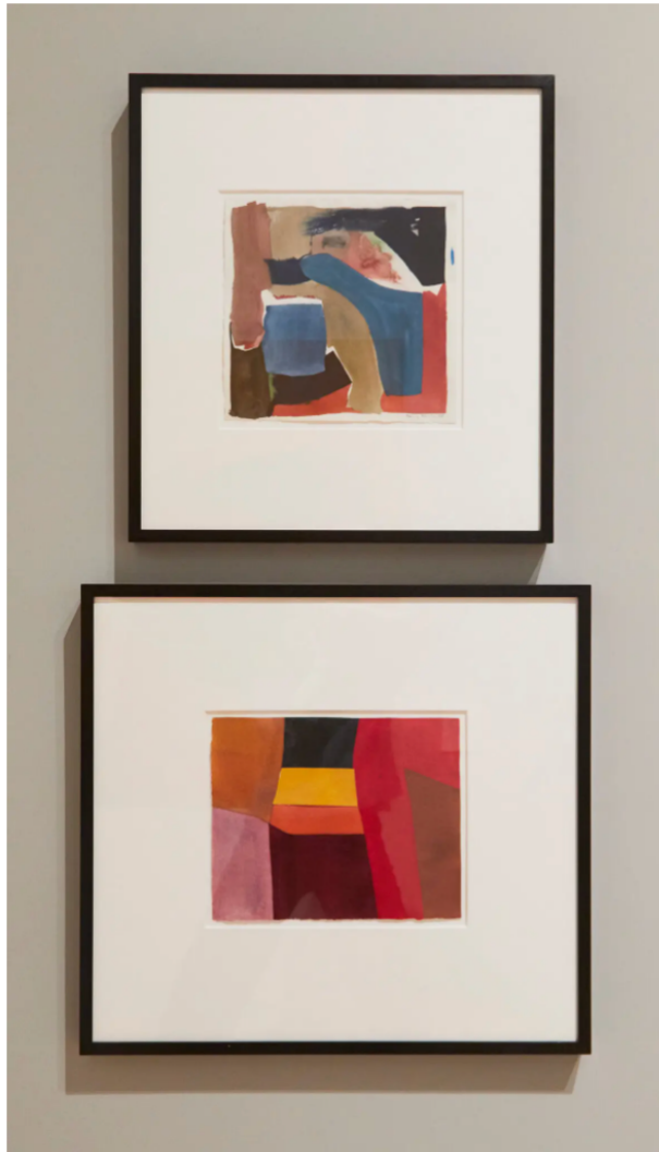
Fanny Sanín's pictures "Watercolor No. 4 (2)" (1968), top, and "Watercolor No. 8" (1968), bottom.