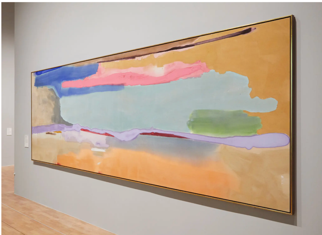
The Whitechapel show opens with “April Mood” (1974) by Helen Frankenthaler.