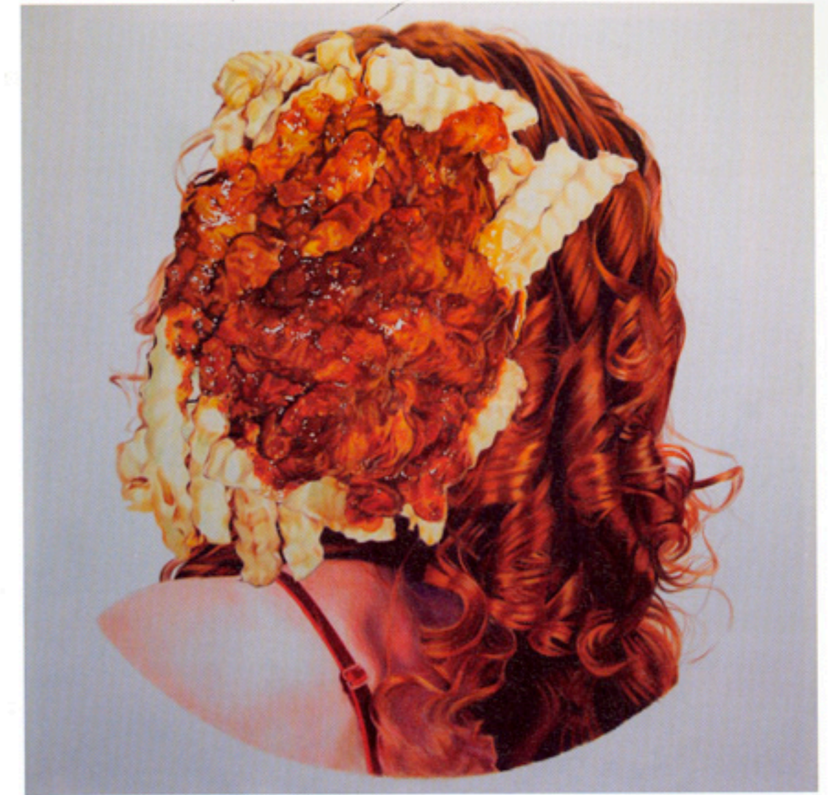
(ABOVE) CHILI FRIES WITHOUT A FACE COLORED PENCIL ON PAPER • 72 X 72 INCHES • 2011